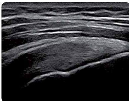
Shoulder, Longitudinal Supraspinatus Tendon