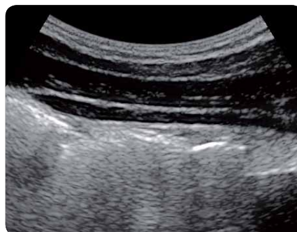
Obliques & Transversus Abdominis